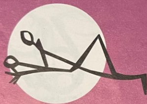
boy on top (also called missionary position)

It is possible to have sexual intercourse in many different positions. You are really limited only by your body's flexibility and your own imagination. Probably the three most popular positions are: