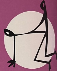
boy behind girl (known as doggie style)

Lubrication: For the movements of sex to go smoothly, it is important that the vagina be well lubricated. Bodies provide their own lubrication, but sometimes not enough. If you find yourself feeling uncomfortable during penetration, you could try a commercial lubricant from a drugstore. Water-based lubricants are the only kind that work with condoms.