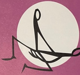
girl on top